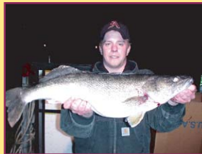
Bull Shoals Walleye