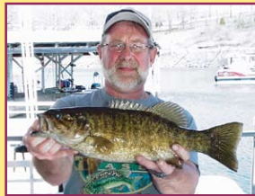
Bull Shoals Small Mouth