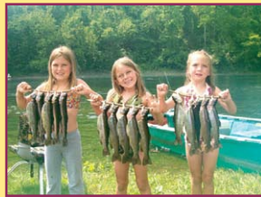
White River Rainbows

2 Persons with guide (3 lunches) 24 3 Persons with guide (4 lunches) 32