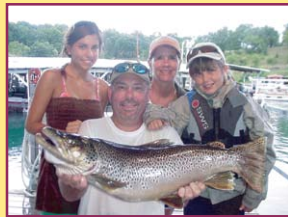
White River Brown