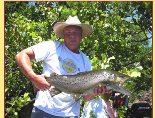
White River Brown