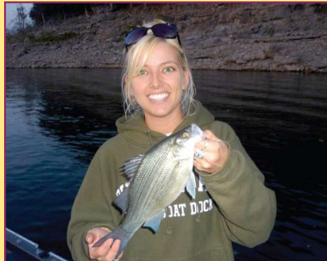
Bull Shoals White Bass